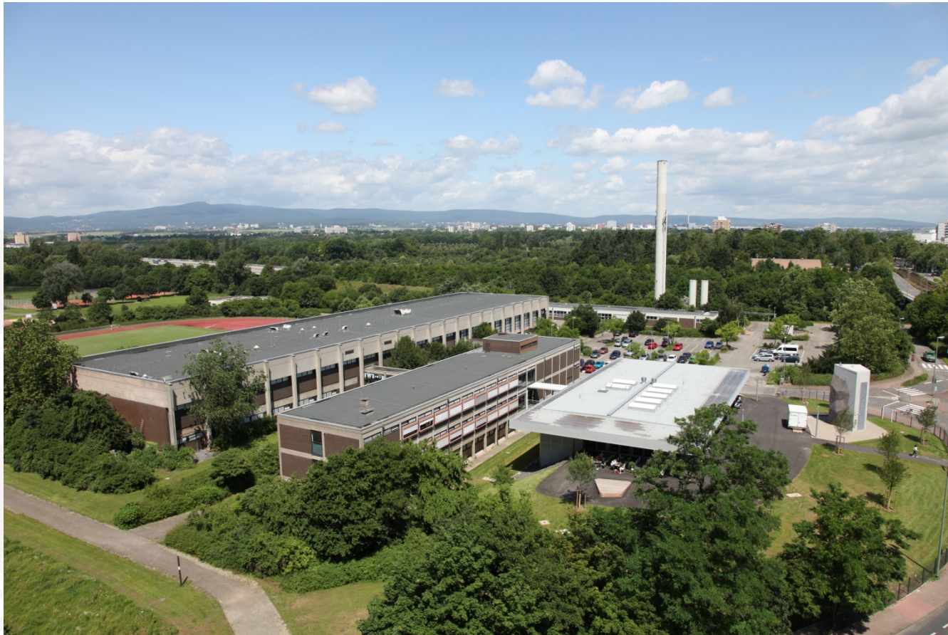
GU's campus for Sport Sciences